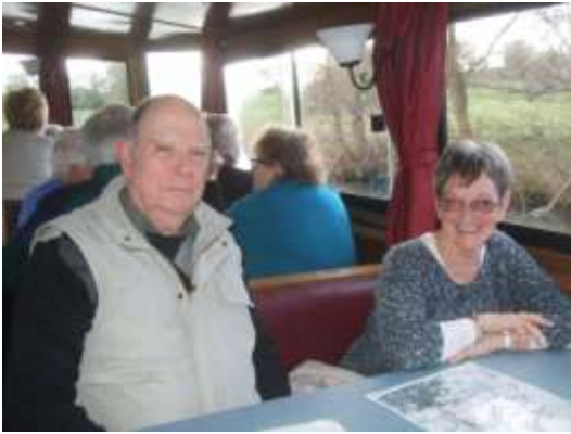
Canal cruise with Boundary Mill