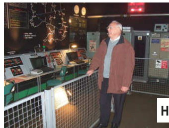
Hack Green nuclear bunker